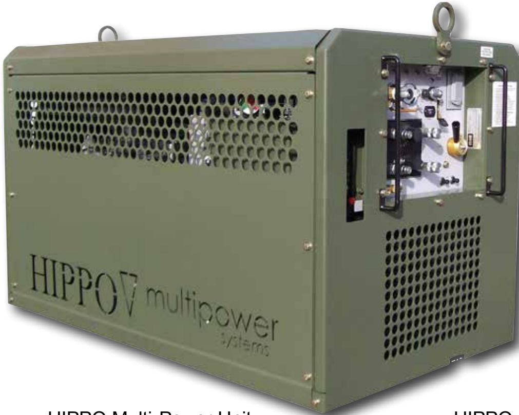
HIPPO Multi-Power Unit MPU 2032E NSN: 5120-01-590-1751